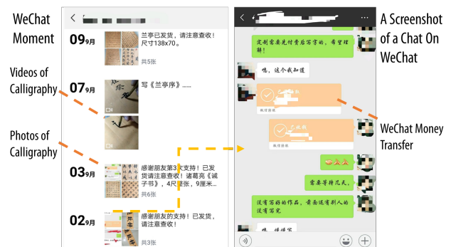
Figure 2: Left: A WeChat Moment where S6 shares photos and videos of calligraphy; Right: A screenshot of the conversation about a transaction for calligraphy, showing the money transfer, which is shared in a WeChat Moment.

Viewers are also actively using WeChat Moments. For example, V1, V2, V4, and V5 all reported posting photos or videos of themselves crafting or learning skills. Streamers sometimes comment on these posts to provide the poster,