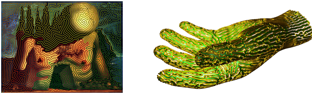
Figure 18: Labyrinth by Salvador Dali, overlaid with a labyrinth and Figure 22: a Planair maze.