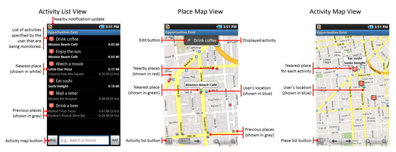
Figure 1. The interfaces for Opportunities Exist; excluding the place list view. The activity list shows all the activities entered into the application sorted by the nearest potential place; this is the default view. The place map shows the location of potential places to perform a specific activity. The activity map shows the location of the nearest potential place for all the activities.

where she can perform her activities, near her current location and all future locations she will visit. Unlike a traditional location-based search service ( e.g. , Google Mobile, Yelp) that allows the user to conduct on demand searches with keywords, Opportunities Exist performs on demand and continuous discovery of places where the user can perform her activities. For example, if a user wants to acquire knowledge about " places to ride a bike ?" or where there is " something interesting to do around here ?" she can use the intended activities ( i.e., ride bike, do something interesting ) not generic key phrases ( e.g., bike, community center , or interesting places ).