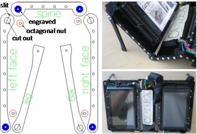
Fig. 4. Left: Exploded view of the detent hinges and support legs. Right: Articulation of the hinges and extension of support legs makes many ergonomic variations possible.

The Codex allows detaching screens, while also providing a hinge with distinct detents to afford facile articulation of the screens (Fig. 4). Each screen is held in place by a base plate, made from the bottom of the "Executive Case" accessory for the OQO Model 02 computer. A firm pull on the screen pops it out of the base, and a firm press pops it back in. The Codex case can still be used as an input device to specify postures even if one or both screens are detached.