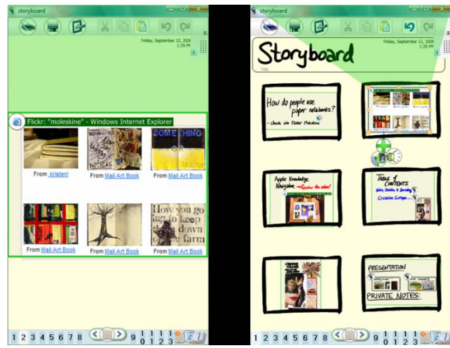
Fig. 8. A storyboard authored using Codex Sidebars.

The software does not currently implement a Back function to undo page link navigation. With two screens a Back feature is not needed to return from a single level of hyperlinking, because the original page with the navigational structure remains visible. With a single screen, navigating to the content occludes the navigational structure, leading to tedious window management tasks such as tabbed browsing or opening links in new windows.