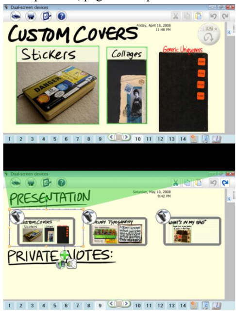
Fig. 7. Previewing a page link with the screens in landscape orientation. Selecting a link on the bottom page previews the linked page on the top screen.

The user can create a hyperlink to any page of their notes by dragging a page tab (the numbered tabs at the bottom of each screen) onto the drawing canvas. This creates a round hyperlink icon, with a thumbnail of the linked page attached to it. Stroking down on the icon opens the link and navigates to the page on the opposite face of the Codex. In collaborative postures, page links open on the same face.