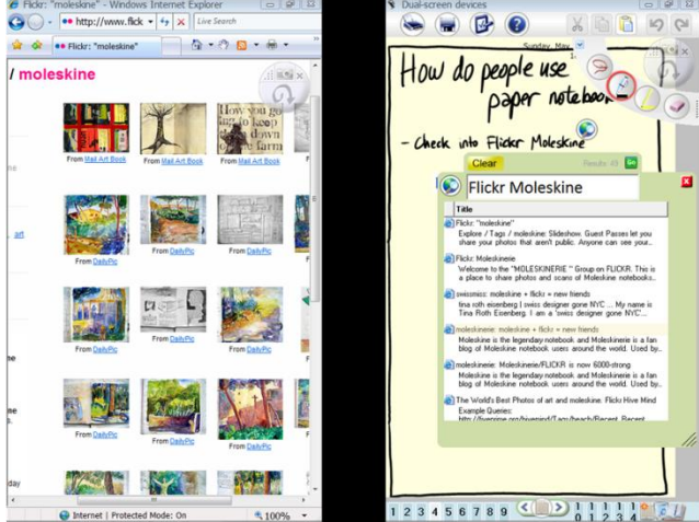
Fig. 6. Bringing up a web page side-by-side with a notebook page.

A key task scenario for the Codex is to support writing notes on one screen in conjunction with reading on the other screen. However, reading and writing themselves are part of a larger task: how does content come to populate the other screen in the first place? The user must hunt for that information, open it, and then gather useful pieces back into their writing [1,7,18,32]. Our software supports this huntergatherer workflow. The user starts by writing a phrase on the primary screen. When the user lasso selects the phrase and chooses the Search command, the Codex shows the results. Clicking on a search result opens the web page on the secondary screen (Fig. 6).