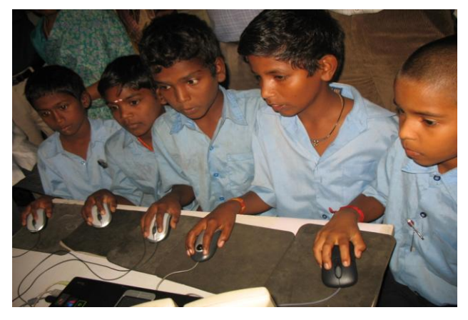
Figure 7. Preliminary field tests with school-children

At the time of publication, we have observed a total of 30 children using the material over 6 groups. Each of the tests took place in a real-world setting, at a low-income corporation school which was participating in the state computer-aided-learning program. The observations were all done during school hours inside the computer lab with 5 children per computer at the time of the test. No specific instructions related to multi-mouse were given to the students, to observe how quickly they get acquainted with the new scenario.