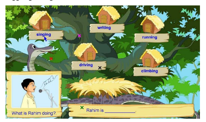
Figure 2. The game implemented using Turn-Taking Model

To implement the turn-taking modality in our test application, we need to emphasize which specific user's turn it is to answer. This is done by changing the font color of the question and answer text on-screen, according to the color of the active cursor. The active cursor is the one belonging to the student whose turn it is to answer. To prevent the other students from answering, their mice cursors are represented as a cross and disabled (though they are visible and can move, but cannot click on anything, Figure 2). Content developed using this model gives all the students a fair chance to participate as all of them get equal number of questions, which also makes this different from Inkpen's work [15] which also experimented with turn taking of sorts, but directed by the users themselves toggling a single on-screen cursor between two mice.