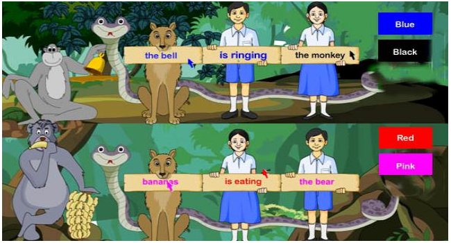
Figure 6. The game implemented using the Split-Screen Model

The split-screen model has also been trialed in other research and found to be highly effective in increasing collaboration without losing engagement and competitiveness within a group [8]. In our implementation, the game screen was split into two halves so that two students (or two groups) can play simultaneously in their respective halves. In the game developed using this model, two random teams were formed by dividing the students (Figure 6). Each team was allotted one part of the screen, and teams can only answer the questions appearing in their part. The team which answers first gets rewarded. The game moves forward only after questions in both the halves were answered correctly.