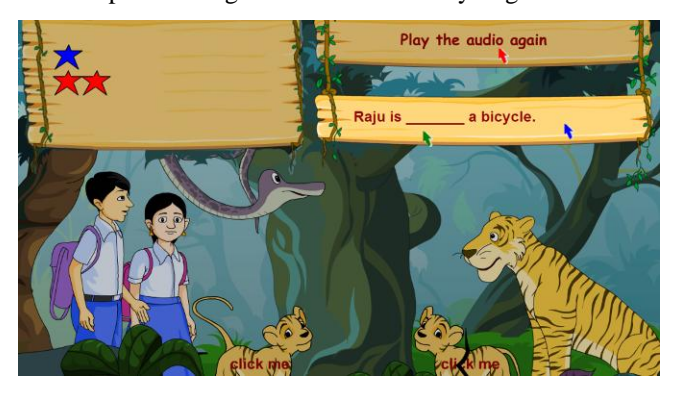
Figure 1. A multiple choice question with the Racing Model

As the name suggests, it's the 'fastest-finger-first' model. Any student can answer the questions, and the child who clicks the correct answer first, gets rewarded, in the form of stars (colored the same as their cursors) (Figure 1). Any content that tests basic concepts can use the racing model, as the questions can be answered quickly. This model is competitive in nature, and from [3] we expect that it will be engaging, however pedagogical efficacy is not guaranteed, and competition might not be the best way to go forward.