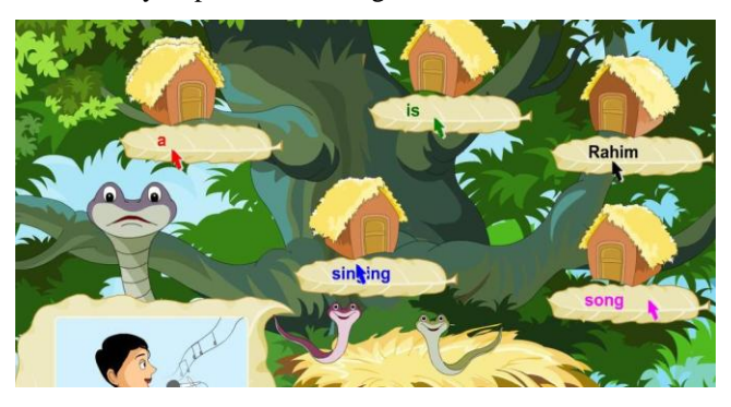
Figure 5. Showing the game implemented using Unity Model

collaboration is enforced. This model encourages sharing of knowledge among the students and also develops the spirit of team work. The content where the answer requires proper selection and arrangement of options can be comfortably implemented using this model.