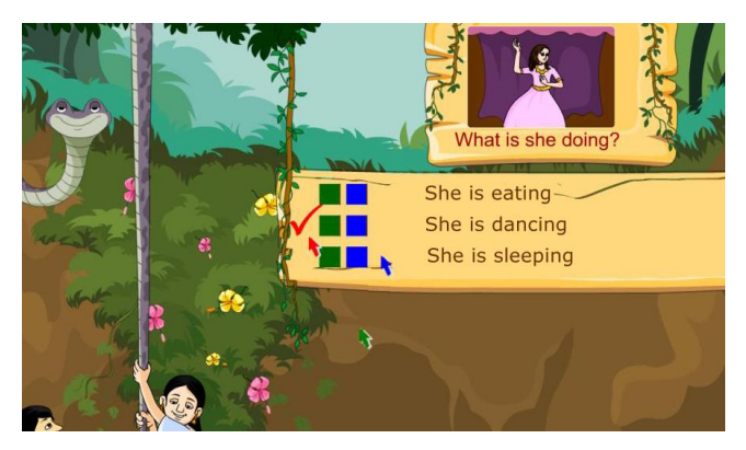
Figure 3. The game implemented using Directed MCQ Model