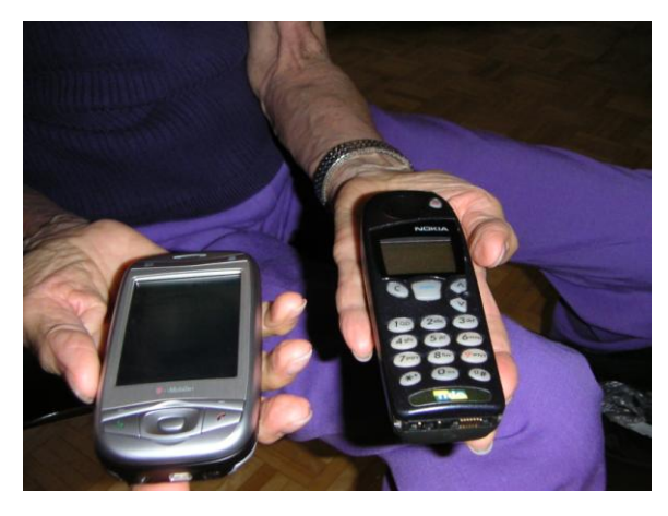
Figure 4. P1 compares the i-Mate K-JAM used in the study (left) with her own "hand-me-down" Nokia mobile phone (right).

Based on the features describe above, we built a prototype system that the team named Recall . We describe the hardware and software that comprise the Recall system here.