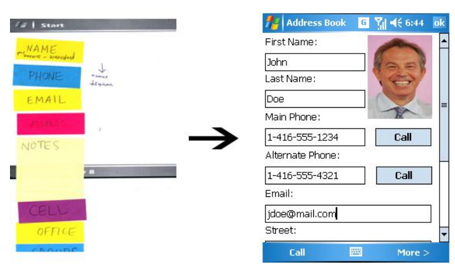
Figure 5 demonstrates the evolution of the Address Book software. We moved from a paper prototype to a software version. In comparison we show the business-oriented Contact manager. All prototype software was written in C#.NET using the Pocket Outlook Object Manager API, allowing interoperability with other pre-existing phone functions. We edited the registry to change the Start Menu items to reflect the Main Menu that the team sketched.

The seniors envisioned a system with 7 main functions. Due to time constrains we could only prototype 5 of these. Of these 5, the seniors created paper prototypes for 2 and we created 3 based on discussion. The calendar paper prototype was not sufficiently different from the built-in Windows Mobile Calendar application to warrant rebuilding it.