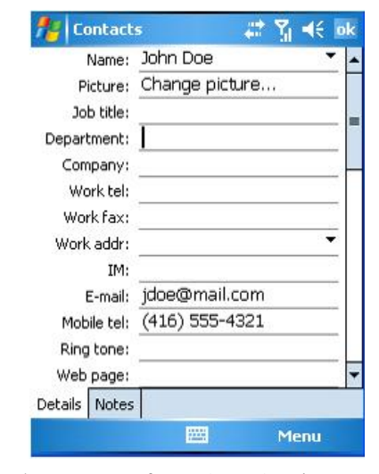
Figure 5. The paper prototype for the address book (left) was developed into the Address Book prototype software (center). It is simpler than the business-oriented Contact Manager in Windows Mobile 5 (right).