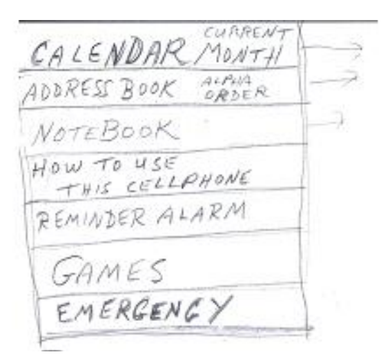
Figure 3. The "Main Menu" as sketched out by the design team contains the most important application areas.