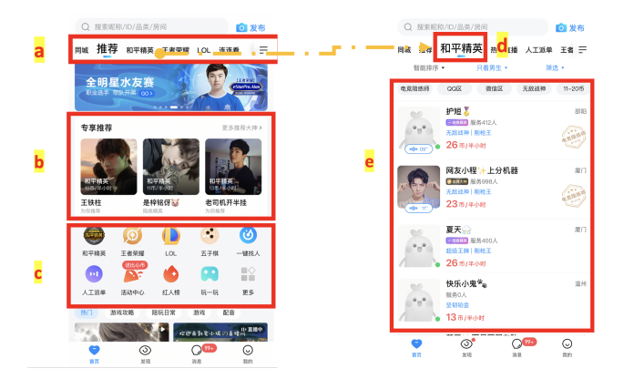
Figure 1: Left: The main page of Bixin, which contains: (a) buttons to "same city" page and popular game sections, which are: PUBG mobie, Kings of Honors and LOL; (b) Top 3 recommended paid teammates for a gamer; (c) all other game sections. Right: (d)All of the recommended paid teammates under a game section, (e) a list of recommended paid teammates.

5.2.3 Story Space in Bixin. Story space is used as a mechanism to further enhance the character portrayed by the profile, and thus acted as a self-advertisement mechanism. By observing the Story Space of the paid teammates' recommended to the researcher in