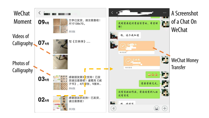
Figure 2: Left: A WeChat Moment where S6 shares photos and videos of calligraphy; Right: A screenshot of the conversation about a transaction for calligraphy, showing the money transfer, which is shared in a WeChat Moment.

Viewers are also actively using WeChat Moments. For example, V1, V2, V4, and V5 all reported posting photos or videos of themselves crafting or learning skills. Streamers sometimes comment on these posts to provide the poster,