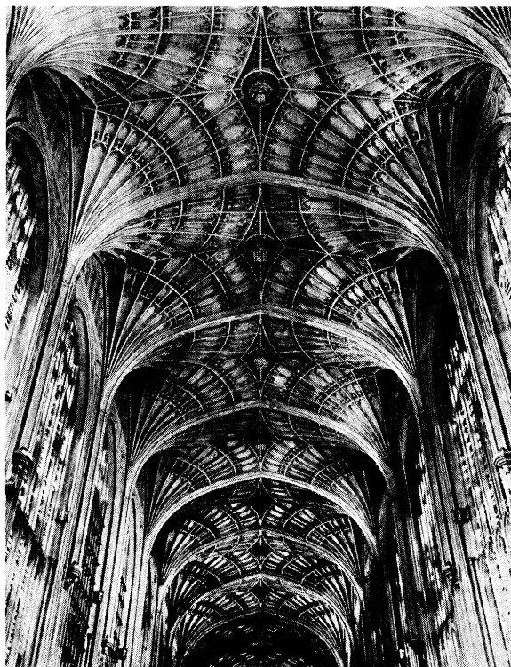
FIGURE 2. The ceiling of King's College Chapel.

the Tudor rose and portcullis. In a sense, this design represents an 'adaptation', but the architectural constraint is clearly primary. The spaces arise as a necessary by-product of fan vaulting; their appropriate use is a secondary effect. Anyone who tried to argue that the structure exists because the alternation of rose and portcullis makes so much sense in a Tudor chapel would be inviting the same ridicule that Voltaire heaped on Dr Pangloss: 'Things cannot be other than they