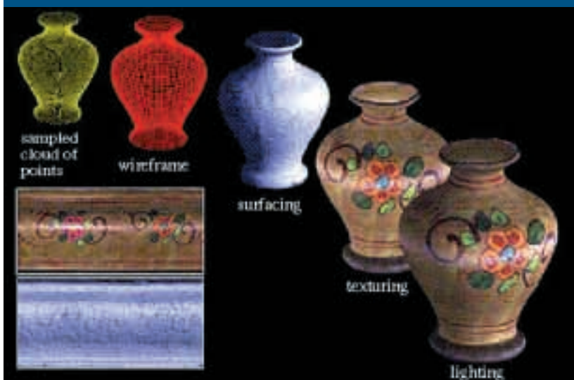
Figure 3. Various stages in reconstructing a scanned vase.