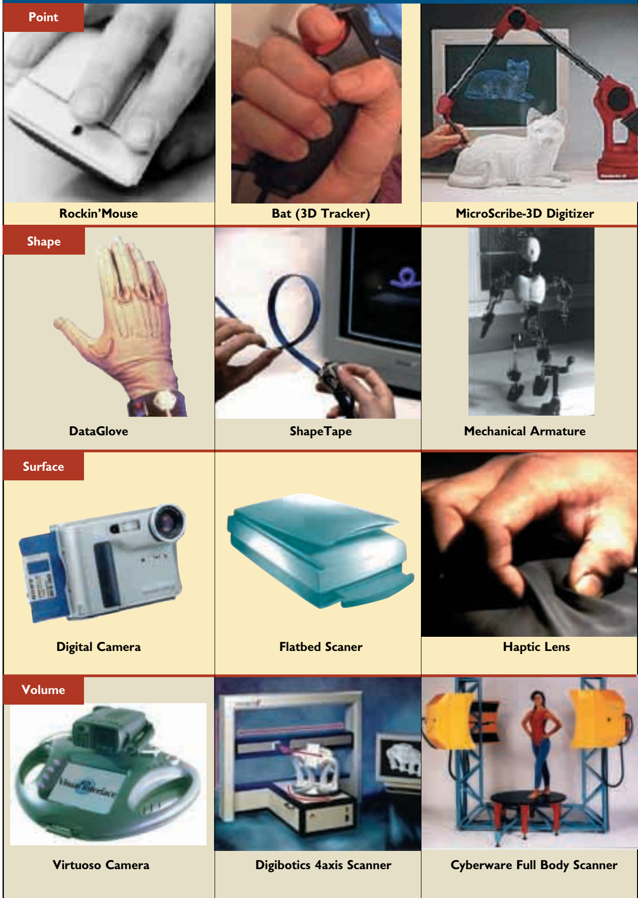
Figure 2. Examples of sampling devices in spatial hierarchy.