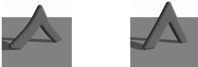
Figure 7: Varying the characteristics of a deformable solid: (a) a flexible solid, (b) a stiff solid.