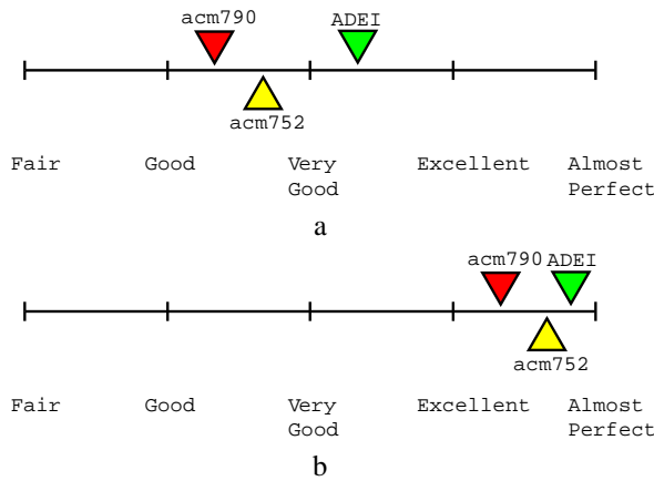
Figure 2. a- Expected fit over functions F_1, F_2 on node sets I-VI; b- Expected fit over function F_3 on node sets I-VI.