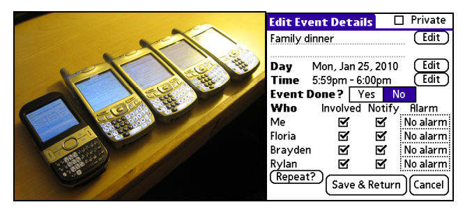
Figure 1.1 (left) Palm devices running Family-Link software. (right) A screenshot of the event editing view in Family-Link.

In this paper, we present the evaluation of a collaborative memory aid called Family-Link (see Figure 1.1). This system was designed with PwAs<sup>1</sup>, their family members, and clinicians. We evaluated Family-Link in a real-world deployment with four families with a PwA over six months. The study compared Family-Link and the Palm Calendar, the latter being the system with which participants were most familiar. Results suggest that participants shared more events when using Family-Link as compared to Palm Calendar. We learned that Family-Link also increased awareness of other family members' schedules. For caregivers, this meant a greater sense of security, increased time savings, and a reduction in the amount of effort needed to coordinate. Persons with amnesia and caregivers found different aspects of Family-Link useful. Design implications arising from our results are discussed.