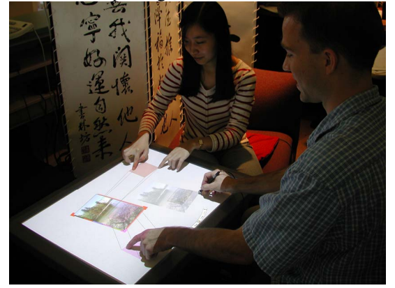
Figure 1: Two people using freehand gestures to interact with the same image document on a table.

Recent research on multi-input direct-touch interaction [18, 26] has developed interesting gestural interactions that address some of these challenges, but not in a systematic manner that is easily extensible to larger and more complex application domains. Furthermore, the resulting gestures typically bear little conceptual relationship to one another, making it difficult for users to understand the range of possibilities. Our goal is to develop design principles that can enable designers to construct new freehand, multi-point and multi-shape gestural interaction techniques whose invocation and action are easily understood and performed by users. Specifically, we propose the concepts of gesture "registration", "relaxation", and "reuse", allowing many gestures with a consistent interaction vocabulary to be constructed using different semantic definitions of the same touch data. To illustrate the generality of these principles, we develop and evaluate example gestures within a tabletop publishing prototype (Figure 1) that acts as a vehicle for exploring our ideas.