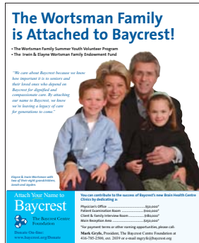
PHOTO: A twice-yearly newsletter and a series of full-page ads in the Canadian Jewish News are inspiring others to attach their names to Baycrest.